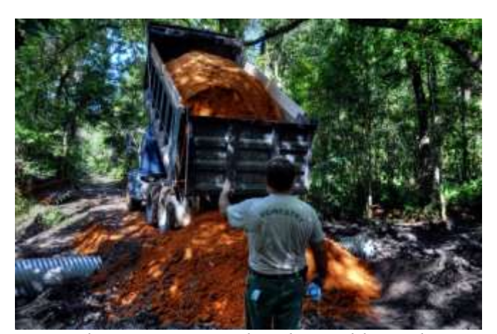
New Culvert on Coit Road in the Withlacoochee Forest near Colter Hammock. Major road improvements were provided by the State Department of Forestry.